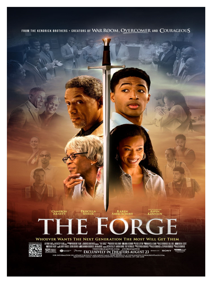
Sunday, June 8th 6:00 p.m.